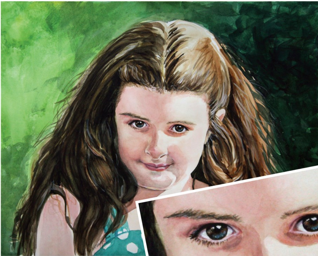
↑ Kaitlyn, watercolor, 16" x 20" (see detail, at right)